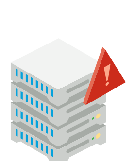
like CPUs can result in breakdown of power units over time